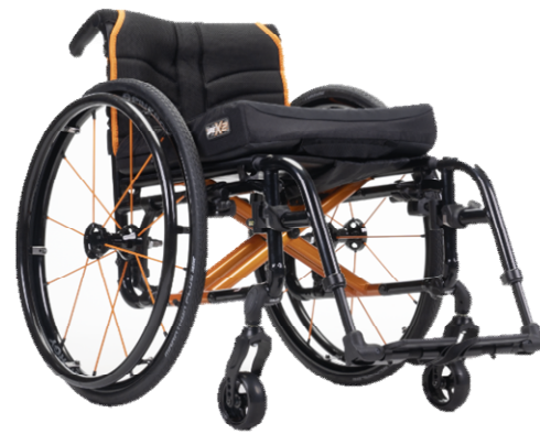
QS5 X - Swing Away