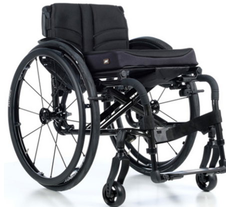
QS5 X - Fixed Front