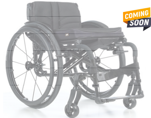
QS5 X - Fixed Front