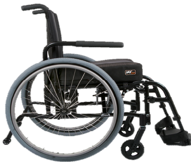
Quickie QXi, Ultra Lightweight Adjustable Folding Wheelchair