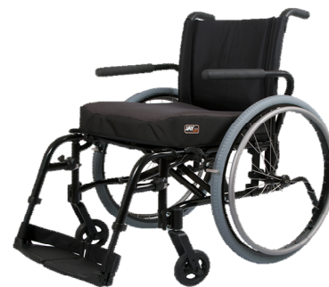
Quickie QXi featuring the Jay ION™ cushion