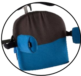
Flip Away Laterals