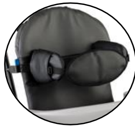
Flip Away Laterals and Chest Support