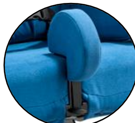
Wedge Shape Pommel