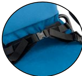
Pelvic Belt 4-Point