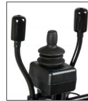
VersaGuide With Flex Switches