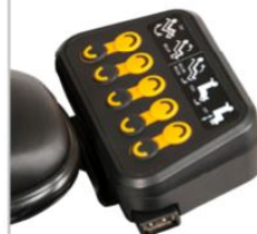
Ctrl+5®, Push Button