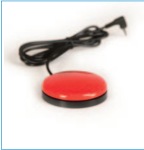
2.5" Single Switch

Individual remote switches for individual access. SWITCH-IT provides a number of different individual switches, which can be used as inputs for drive control systems or other functions.