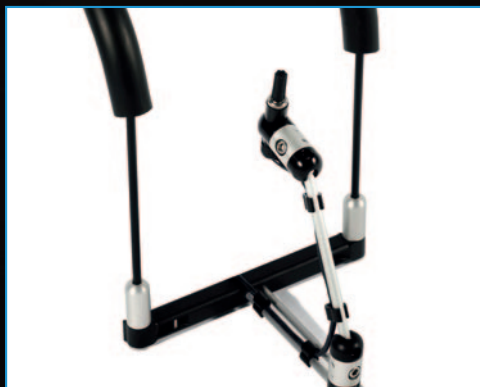
Mini Joystick on Chin Harness