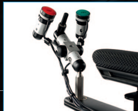
Mini Joystick with Extra Switches