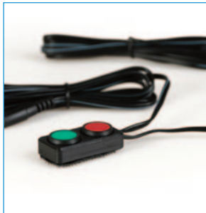
Mini 2 Button