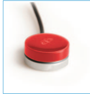
1" Single Switch