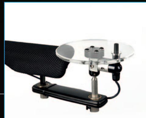
Mini Joystick on a SunDisk