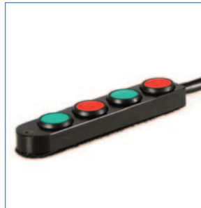
Mini 4 Button