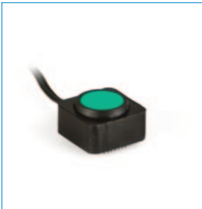
Mini 1 Button