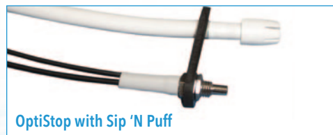
OptiStop with Sip 'N Puff