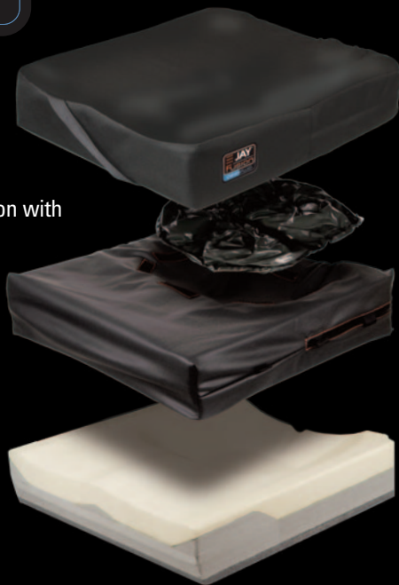
JAY Fusion Cushion with Cryo Technology