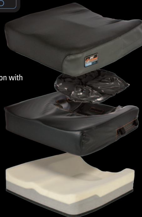
JAY Syncra Cushion with Cryo Technology