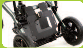
LTV/Trilogy Ventilator Hardware Dovetail vertical framemounted hardware