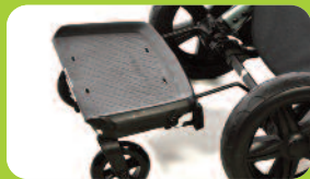
Rear Accessory Platform