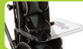
Upper Extremity Support Tray Angle/depth adjustable hardware included