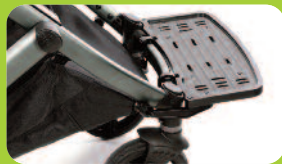
Front Mount Utility Platform