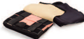
Adjustable Contour Seat