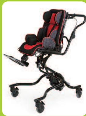
JCM Hi-Lo Base Height Adjustable

The Zippie Voyage is available with options designed to make daily tasks a breeze.