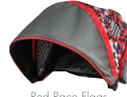
Red Race Flags