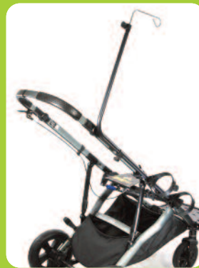
IV Support Pole