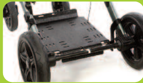
Battery, Vent or Utility Tray