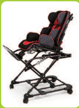
Folding Booster Base Height Adjustable