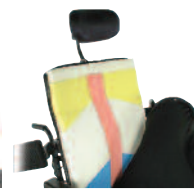
JAY or ART SPO Backrest E2613, E2617