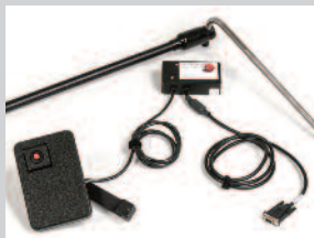
ASL Micro Joystick