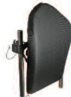
J3™ Posterior E2613