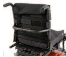
Quickie® Tension Adjustable Upholstery