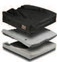
J2™ / J2 DC E2622, E2623, E2624, E2625