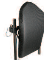
J3™ Posterior & Lateral E2615