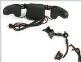
Switch-It Head Array