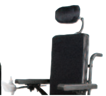
JAY SPOT Curved or Curved Recline Back