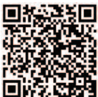
Specialty Controls Videos