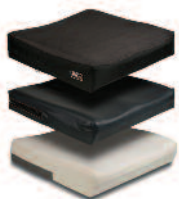
Ion™ E2607, E260