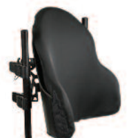
J3™ Posterior & Deep Lateral/Contour E2620