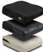
Union™ E2307, E2608