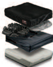
Fusion™ E2622, E2623