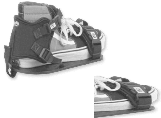
Padded Ankle Toe Strap Only